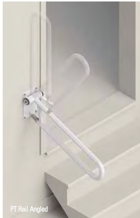
PT Rail Angled