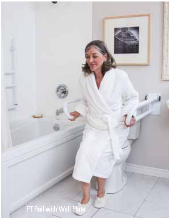
PT Rail with Wall Plate