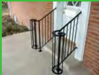
Custom Steel railings