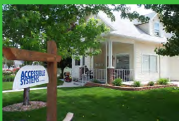
Come Tour our 107 Year Old Adapted ShowHome

Change at Accessible Systems Riding with Paralympic Medalists