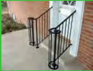
Custom Steel railings