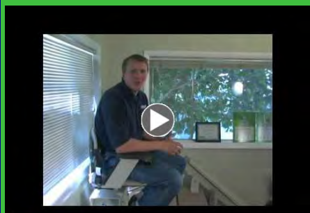
Tour our Accessible Showhome