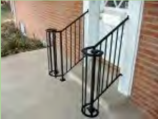
Custom Steel railings