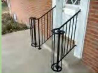
Custom Steel railings