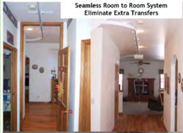
Seamless Room to Room System Eliminate Extra Transfers

Visiting Nurse Association Vendor Fair 9am-3pm @ 390 Grant, Denver CO