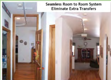
Seamless Room to Room System Eliminate Extra Transfers