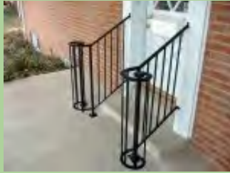
Custom Steel railings