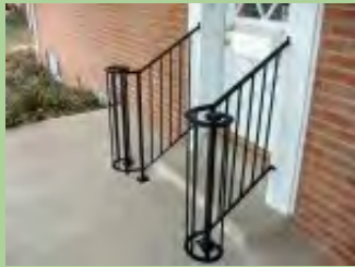
Custom Steel railings