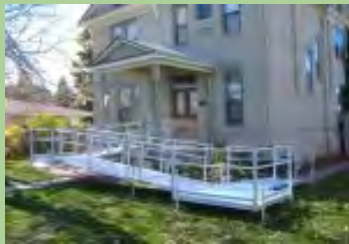
Custom Modular/Portable Aluminum & Wood Ramps