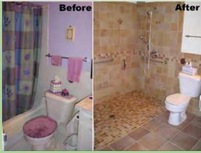
Barrier Free Bathrooms