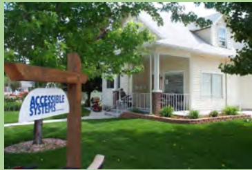
Come Tour our 106 year old Adapted ShowHome

ShowHome Location: 5596 S. Sycamore St. Littleton, CO 80120