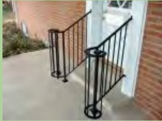
Custom Steel railings