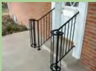
Custom Steel railings