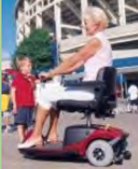
Scooters/Wheelchairs Mobility Solutions