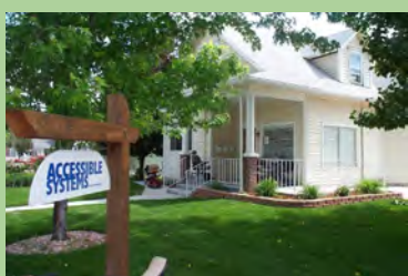
Come Tour our 106 year old Adapted ShowHome

ShowHome Location: 5596 S. Sycamore St. Littleton, CO 80120