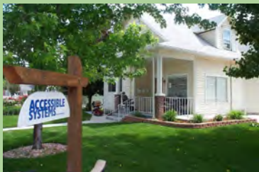
Our 104 year old ShowHome