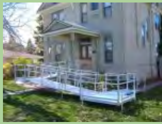
Custom, modular & portable ramps