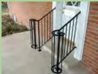
Custom Steel railings