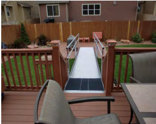
MODULAR RAMP WITH THRESHOLD FOR DECK/PATIO ACCESS

"The additions and renovations to our newly built home were extensive. The project was actually finished ahead of schedule. The end result of this major project exceeded all of our expectations."