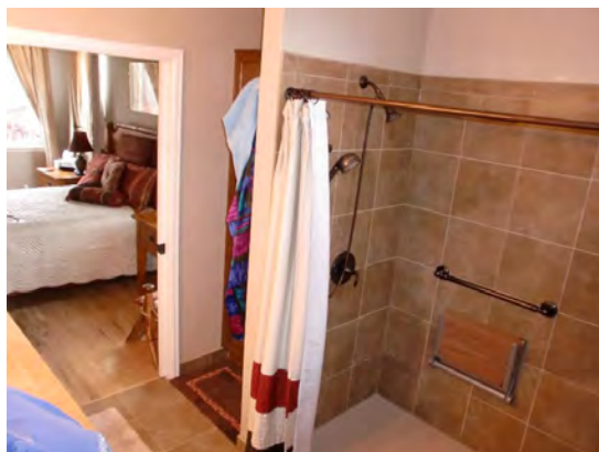
BARRIER FREE BATHROOM DESIGN

"The additions and renovations to our newly built home were extensive. The project was actually finished ahead of schedule. The end result of this major project exceeded all of our expectations."