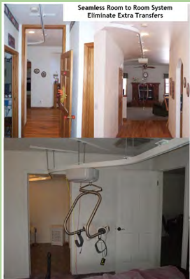
Seamless Room to Room System Eliminate Extra Transfers