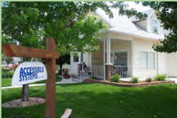
Come Tour our 106 year old Adapted ShowHome

ShowHome Location: 5596 S. Sycamore St. Littleton, CO 80120