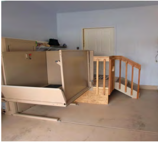
VERTICAL PLATFORM LIFT INSTALLED IN THE GARAGE