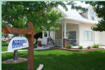
Our 103 yr. old ShowHome

"April showers bring May flowers" so the saying goes. Thankfully, here in Colorado we have the privilege of having winter one day and spring the next and then a repeat....Talk about change!