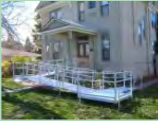
Custom, modular & portable ramps